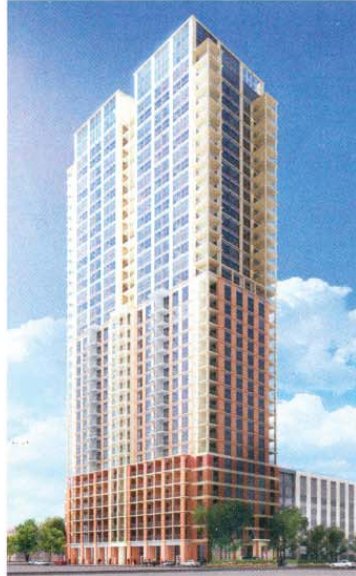
Four Seasons Residences, Town Lake Austin luxury downtown condos broke ground this spring.

Other design team firms involved include BOKA Powell Architects of Dallas and TBG Partners of Austin. Interior design of the lobby,