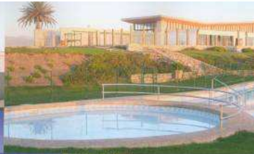
(Above) The Pacific Ocean-side course at La Serena, 300 miles north of Santiago, is world class, and apartments start at €85,000 for a two-bed.