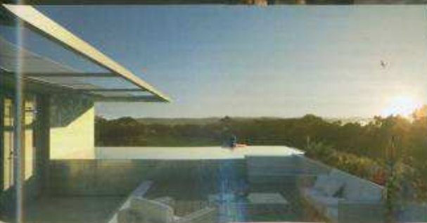
(Above) The Four Seasons Private Residences on the Indian Ocean island of Mahé (featured in the film For Your Eyes Only ) offer spacious terraces and total privacy (Left) With many of Portugal's finest golf courses in the Algarve, The Keys at Quinta do Lago are especially appealing. The villas at Key Lago each have their own private roof terrace, complete with infinity pool